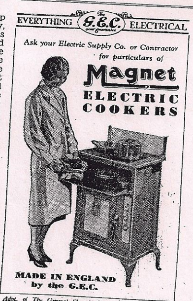
Adol. of The General Electric Co. Ltd. Marnes House Kingsway, London, W.C.2.

"Is there one among the so-called technocrats or among the economists who has expressed the whole dilemma so perfectly?"